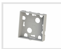
Back part for surface wiring 200.004