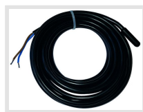
TF06 Temperature sensor