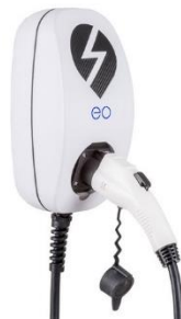
EO Basic Charging Station