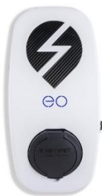
EO Genius Charging Station